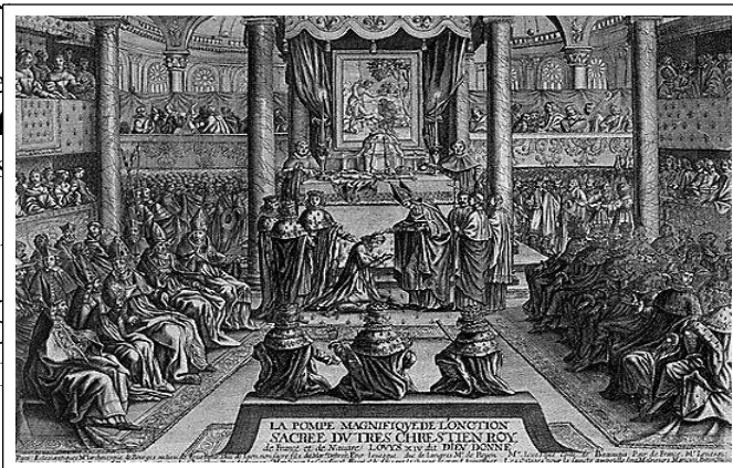
Coronation of Louis XIV of France. Men crown the kings and queens of this world. But Jesus Christ will be crowned King of the earth by the One who possesses all power and authority -- the Creator God, the Father Almighty!

What tremendous event occurs after Jesus is crowned? Will there be a march of triumph climaxing His victory over the nations which opposed His return to establish the Kingdom of God?