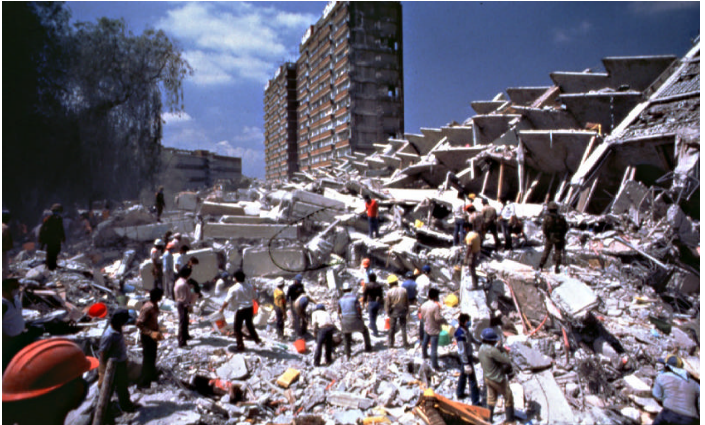
Earthquake in Mexico -- 1985