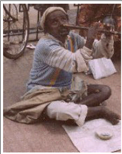
Starving beggar in India. A minute foretaste of famine and disease to plague rebellious mankind!

Indeed you have set out upon the HIGHWAY of LIBERTY! THIS WAY is going to bring to you all THE good things you have EVER desired -- and MORE! God planned it to be so. Thousands of others, like yourself, are now CANDIDATES for the glorious Family of God. They come from all walks of life.