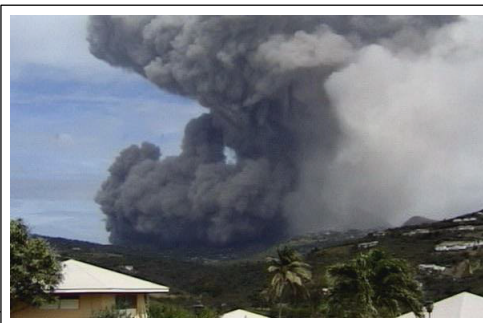
Steam and ash shoots 1000 feet into air from erupting volcano. Hundreds erupting at one time defy the imagination!

I know you won't want to miss a single exciting lesson!