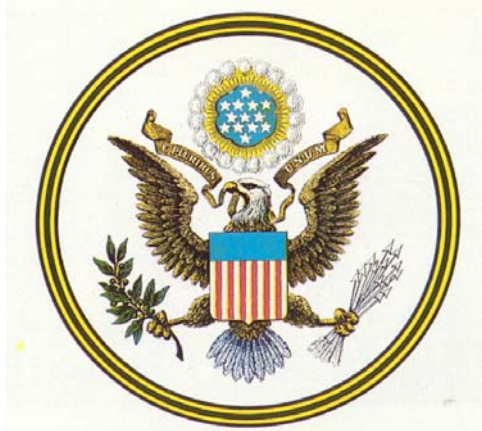
Great Seal of the United States