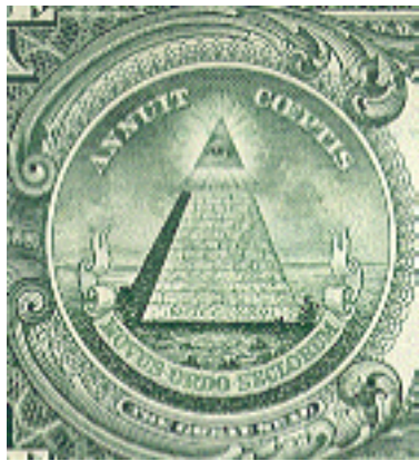
Great Pyramid and All-Seeing Eye