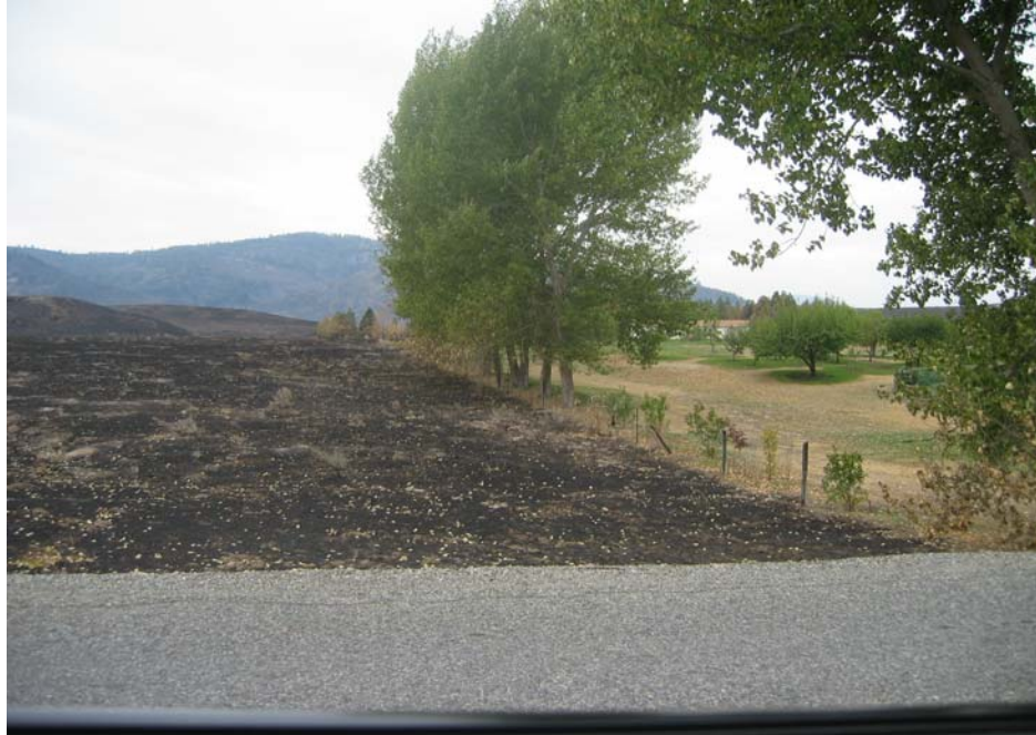
View of the property line. "Thus far and no further," shall thy flames burn.

the poplar trees and our house, orchard, barn and landscaping all intact, looking like a small oasis in the midst of blackened hell. Even our chickens were ok. The lots all along the north side of our property, on Grey Goose Road, were charcoal and cinders. There was no power, water or phone service. The pictures below are scenes of devastation around our home and property in Omak, Washington, due to the wildfires raging in the region in August 2015. The land around our property was scorched and burned to a cinder, but the raging inferno spared our home and trees, and land. Even our chickens survived!