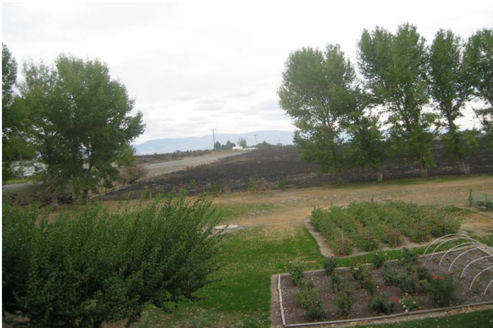
Here is the view from out sundeck looking southward. Even our grape vines and rose garden, in the foreground, and our fruit trees were spared. Even the poplar trees on the fence line survived the onslaught of wildfire.