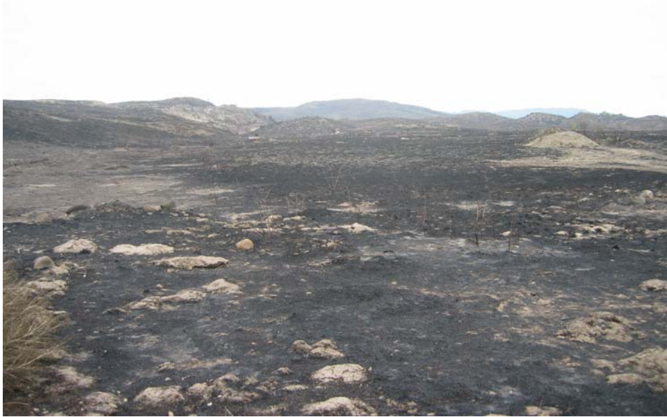
This picture is looking toward the northwest from our home.

It looked like a scene from Mars – barren, lifeless landscape. A horror story of frightful and scary consequences.